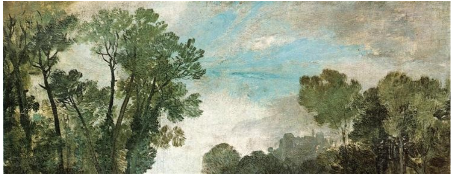
J.M.W. Turner. Tree Tops and Sky, Guildford Castle, 1807 . Tate Modern, London, UK