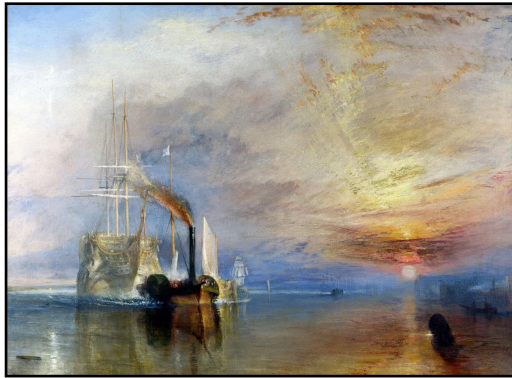
J.M.W. Turner: The Fighting Temeraire Tugged to Her Last Birth to be Broken Up.

In acknowledgement of the event it is proposed we hold a selling exhibition in the Stan Stevens Studio themed “Inspired by Turner”.